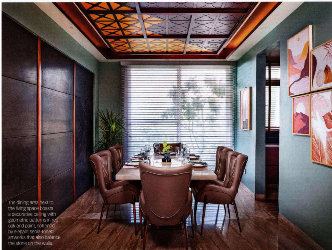
The dining area next to the living space boasts a decorative ceiling with geometric patterns in red oak and paint, softened by elegant sepia-toned artworks that also balance the stone on the walls.